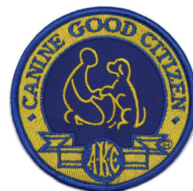
Patches – 2 Sizes