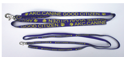
Leashes – 2 Sizes