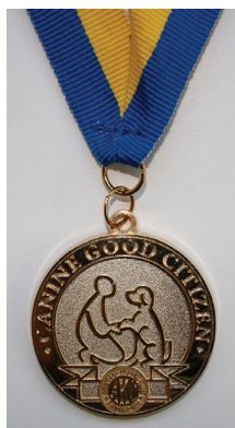
CGC Gold Medal